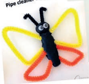
Pipe cleaner creations