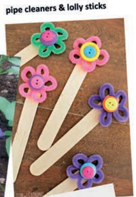
pipe cleaners & lolly sticks