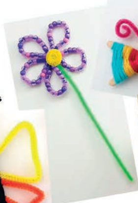
Pipe cleaner creations