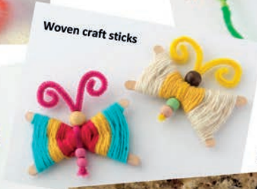
Woven craft sticks