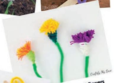
Wool Tassel flowers