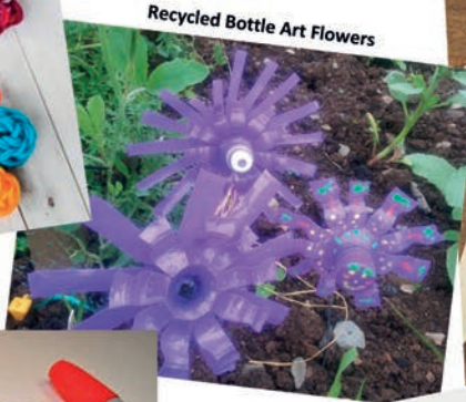
Recycled Bottle Art Flowers